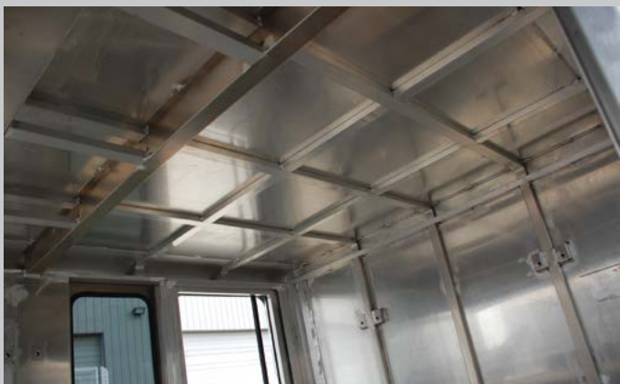
3/16" Thick all aluminum construction with a roll cage extruded aluminum sub-frame.

The Cinder custom fire chassis combines the heavy duty construction you expect from Ferrara Fire Apparatus along with value . The Ferrara Cinder is packed with impressive features including: