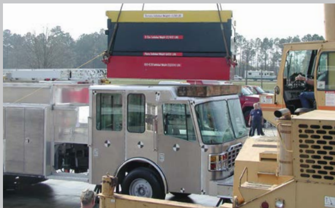
Cab tested to exceed NFPA 1901 crash testing requirements, loaded to nearly 66,000 pounds.