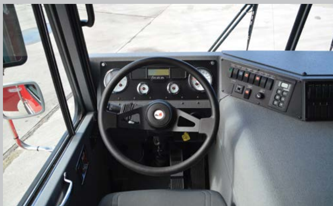
Easy to read white face gauges with LED backlighting and center mounted diagnostic/information display.