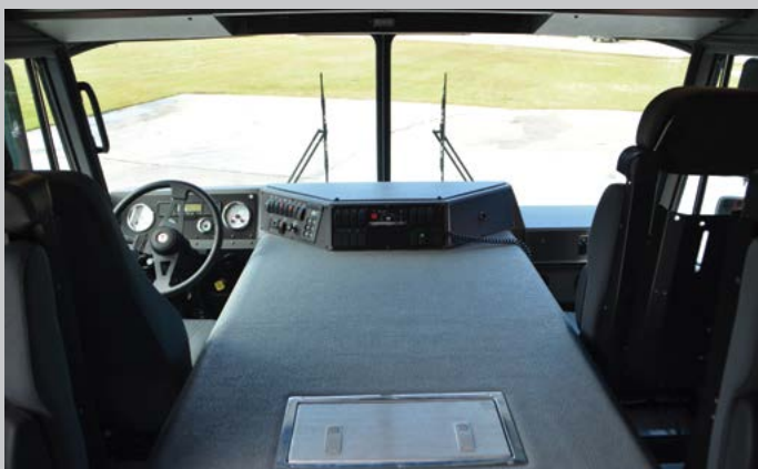
Extreme Duty cab interior. All aluminum instrument & switch panels, dash, overhead console & door panels.