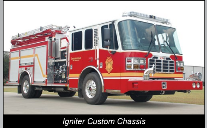
Igniter Custom Chassis