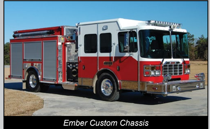
Ember Custom Chassis