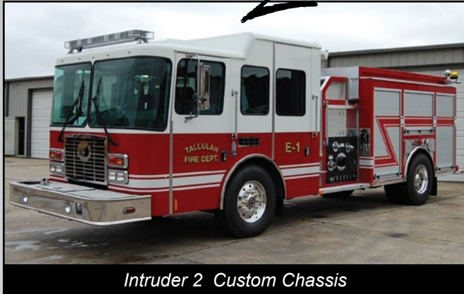
Intruder 2 Custom Chassis