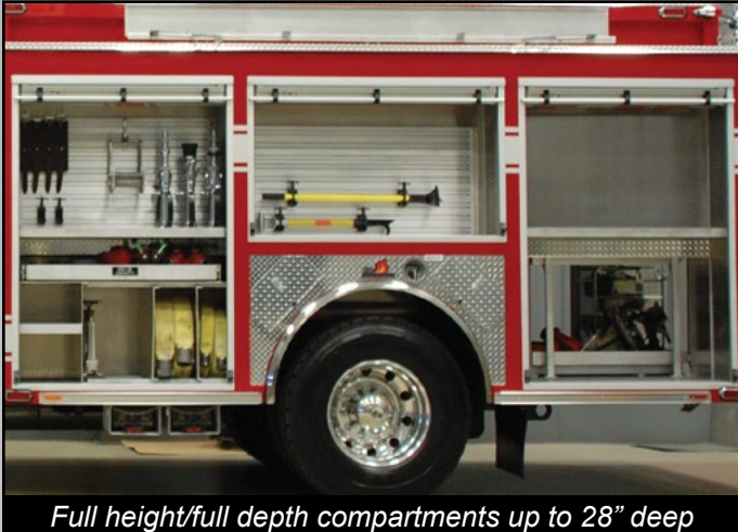
Full height/full depth compartments up to 28" deep

When you need a new rescue pumper, Ferrara's team of experienced engineers will custom design a truck to meet your demands and your unique environment. We will custom build you the strongest vehicle in the industry and add to that specialized storage compartments and brackets to keep your gear safe during transit, easy to access and ready for use at the scene.