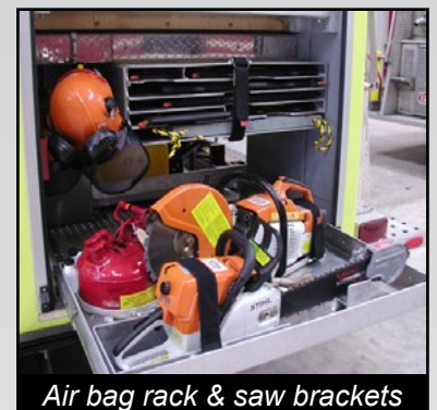
Air bag rack & saw brackets

Who said you can't be all things to all people? Today's fire service demands just that.