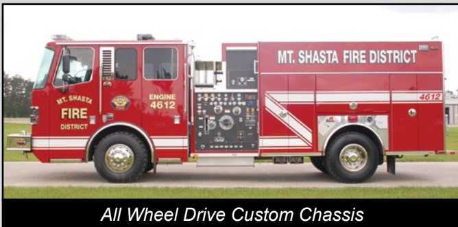
All Wheel Drive Custom Chassis

Ferrara offers many specialty chassis to fit specific needs of some departments such as all wheel drive and a short wheel base.