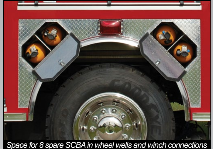
Space for 8 spare SCBA in wheel wells and winch connections