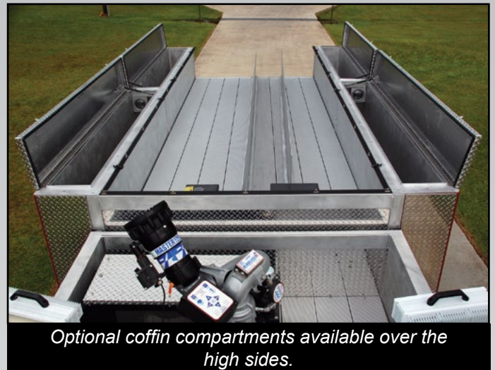
Optional coffin compartments available over the high sides.