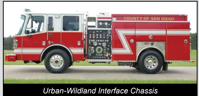
Urban-Wildland Interface Chassis