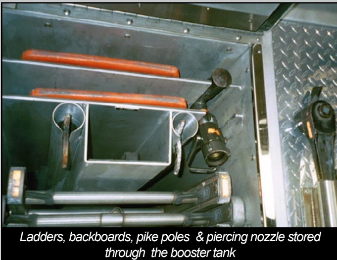
Ladders, backboards, pike poles & piercing nozzle stored through the booster tank