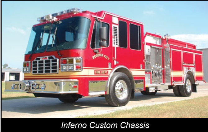
Inferno Custom Chassis