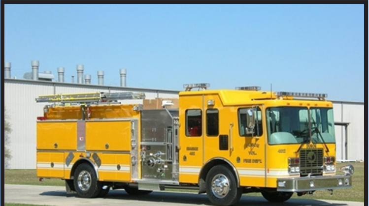
12 gauge galvanneal pumper with double high side compartments