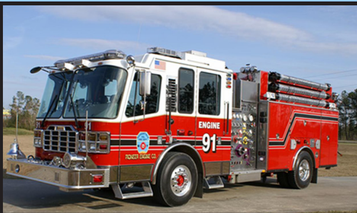
12 gauge stainless pumper with rescue compartments