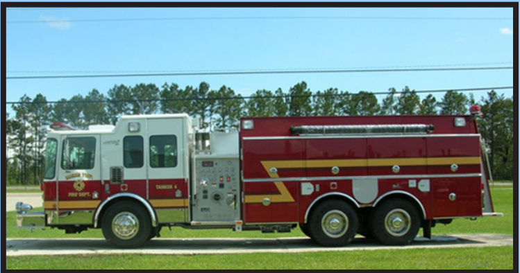
3/16" aluminum, 3000 gallon tanker with optional side dump valves