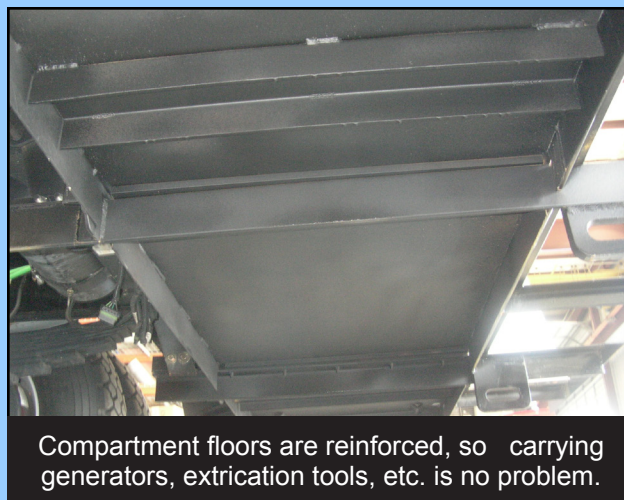
Compartment floors are reinforced, so carrying generators, extrication tools, etc. is no problem.