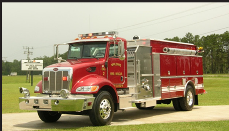
12 gauge galvanneal, 1500 gallon tanker & top mount pump panel