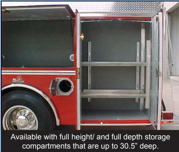
Available with full height/ and full depth storage compartments that are up to 30.5" deep.