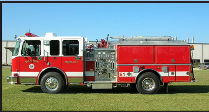
12 gauge galvanneal pumper & optional transverse storage