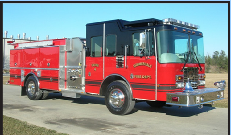
3/16" aluminum top mount pumper & ladders through the tank